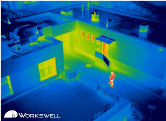
This image was produced at night. The intruder approaches the guarded object and was discovered in time due to the night vision provided by thermal cameras.

Without the option to manually set the temperature range, there is a large risk of not seeing live objects due to insufficient system sensitivity!