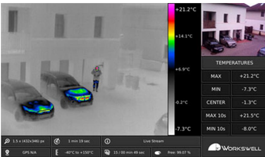
Car engines are kept ticking over meaning they can be quickly started in a short time.

Today, security is an expression that is very sensitively used in all areas of our lives. Security measures, security risks, security cameras, etc. ensuring the security of loved ones, staff, the city's population, animals and objects is a priority for most of us. It is not easy task and, unfortunately, is not something that can be resolved forever. We will always have to resolve it again and again, because new security risks will always arise. The most frequent source of fear is the risk of entry by undesirable people (or animals) into buildings and onto land. An analogical problem is the search for missing persons in particular areas. Searching from missing persons in an open area during the day is not usually problematic although conditions are not always ideal — fog may appear or the area may be intentionally smoked out. The cycle of the time and day play against us and intruders usually operate under the cover of darkness.